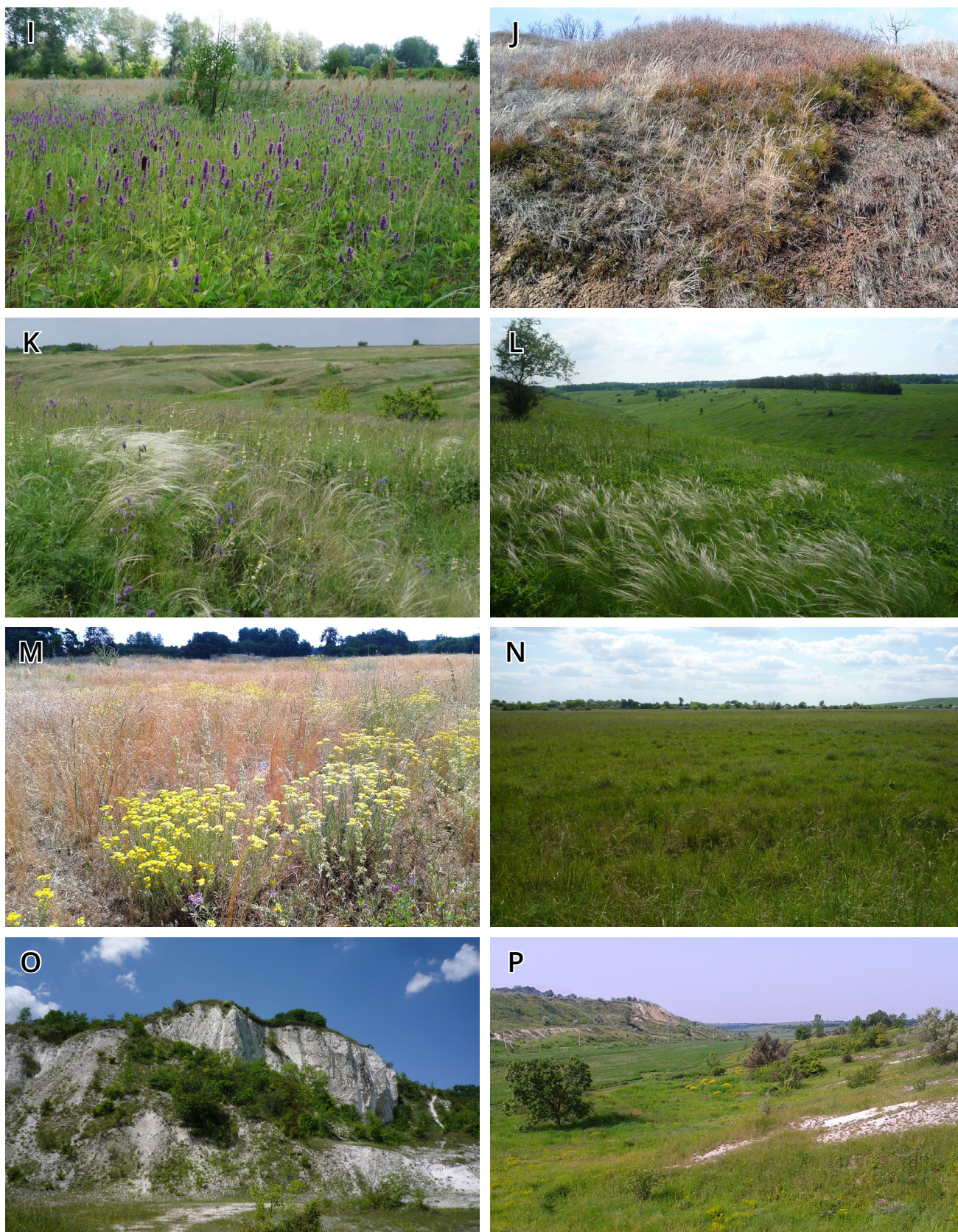
Figure 2. Continued. I – tall-herb meadows near Petrivske village; J – Ephedra distachya among shrubs near Borshchivka village; K – steppe vegetation with Stipa pennata ; L – Stipa lessingiana on the slopes of the Khomyn ravine; M – sandy steppe near Balakliya; N – salted meadows in the Borshchivka village; O – Kreydyana Hora near Protopopivka village; P – chalk outcrops near Milova village.