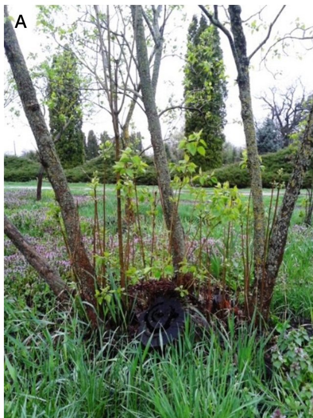
Figure 1. The restoration of the lilac bush by deepening the grafting site.