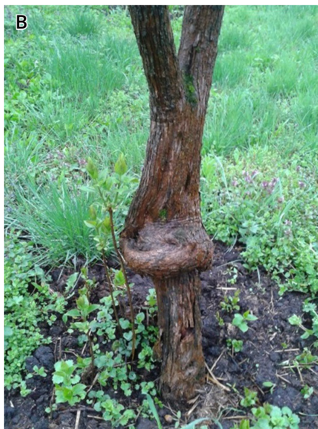
Figure 2. The stem thickness formation at the grafting site.

watery spots on leaves, which rapidly enlarged and darkened, while white fungus formed on the underside of the leaves. The leaves fell off rapidly. Inflorescences often turned brown and failed to develop, and necrosis spread on young shoots. Necrotic spots appeared on older shoots, and some shoots died. These are well-known symptoms of lilac phytophthorosis (Shishkoff, 2007).